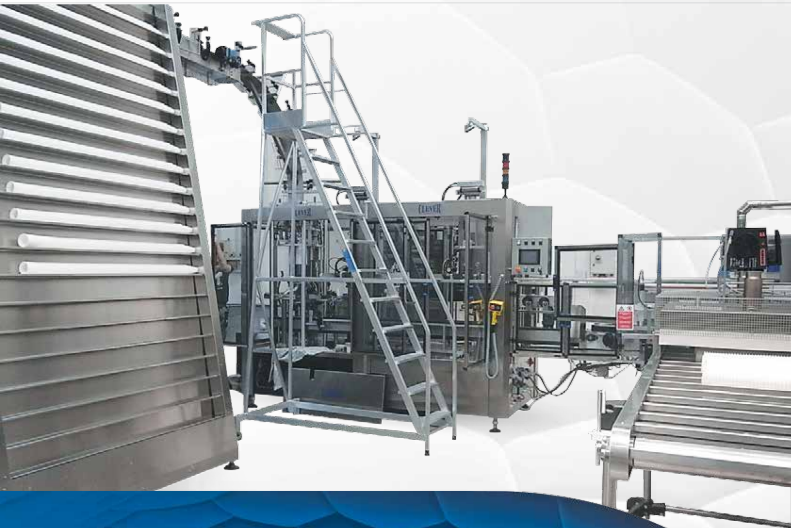
APPLICATOR FOR CUPS