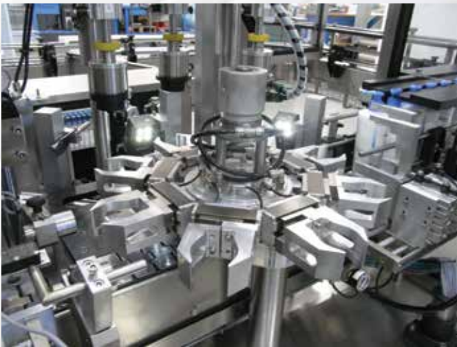
Detail of orientation